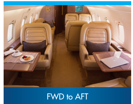
FWD to AFT